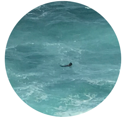
Otter at the property

this rare remaining piece of the Carmel Coast.